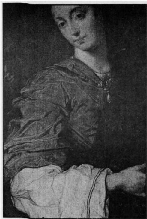
Figure 3: Detail, painting "Vanitas Allegorie" by Antonio de Pereda, c. 1654, Kunsthistorisches Museum, Vienna